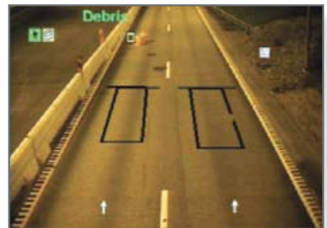
Debris is detected inside or outside the tunnel