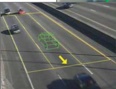
Highway Wizard for easy setup