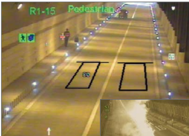
Pedestrians are detected quickly and tracked