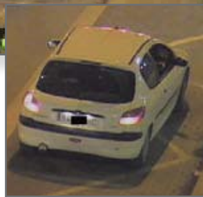
Bus lane enforcement application