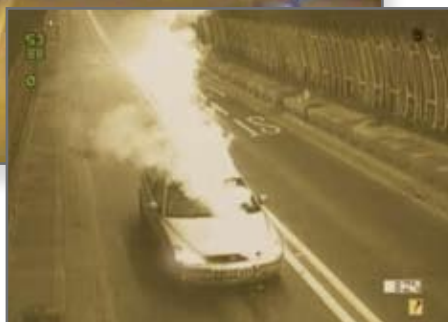
Smoke/fire detection for safety and fast response